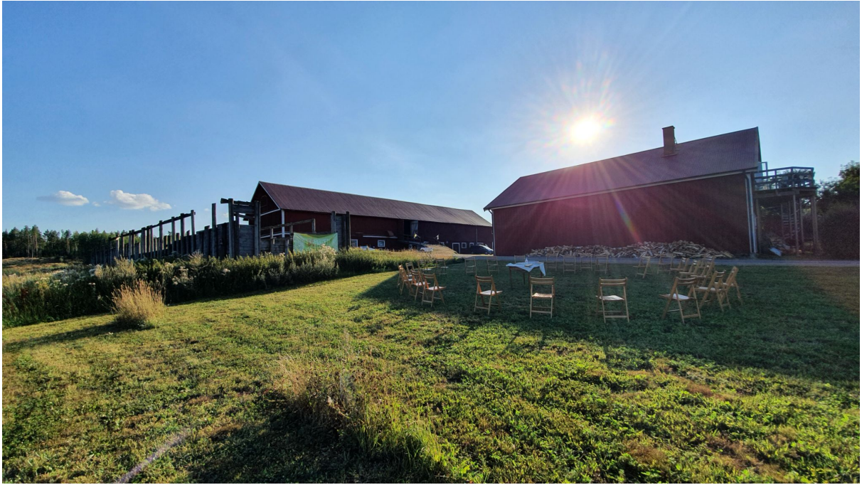
Room 2: The cheer